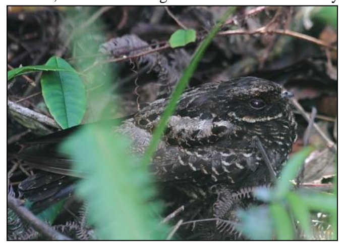
Satanic Nightjar

views of Satanic Nightjar at its daytime roost. On several occasions we encountered good mixed species flocks including the tiny Sulawesi Pygmy Woodpecker, Cerulean and Pygmy Cuckooshrikes, shy Maroonbacked Whistler, Sulawesi Drongo, Rusty-bellied Fantail, Citrine Canary-flycatcher, unusual Malia, secretive Chestnut-backed Bush Warbler, Streak-headed White-eye, Fiery-browed Starling, Sulawesi Thrush, Great Shortwing and Blue-fronted Blue Flycatcher. A real bonus came in the form of good scope