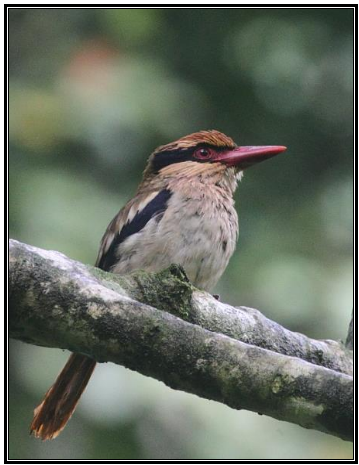
Lilac Kingfisher

17<sup>th</sup> August to 3<sup>rd</sup> September 2013