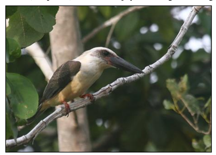
Great-billed Kingfisher

sexually dimorphic Ochre-bellied Boobook, Sulawesi Nightjar and fabulous Ruddy Kingfisher on a night roost (see photo). We also enjoyed unforgettable sightings of Bear Cuscus and the tiny Spectral Tarsier.