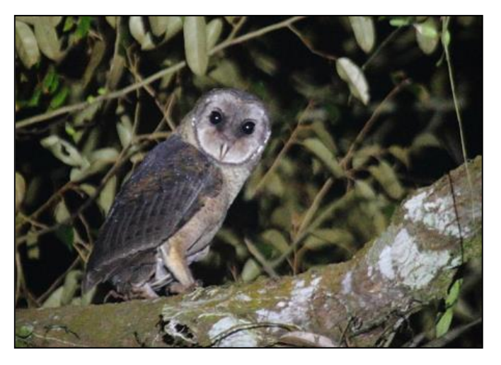
Sulawesi Masked Owl

From here we made our way to Dumoga-Bone National Park, where we explored several sections of lowland and mid-altitude rainforest. An early departure the following morning saw us arriving at the entrance to the park just before dawn, where the lovely calls of several Great Eared Nightjars greeted us and we enjoyed good sightings as these huge birds flew by, heading off to their roosting sites. Two splendid Maleos were seen in quick time and stayed for a good while, giving all of us superb scope views and even posing long enough for some photos. What a great highlight this was and certainly a memory cherished by all! At times we weren't quite sure which way to look as a splendid Green-backed Kingfisher made an appearance, and