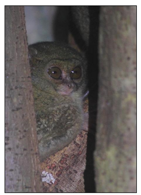
Spectral Tarsier by David Hoddinott

We next continued with a visit to Lame Forest, which had us all creeping stealthily along a forest trail and