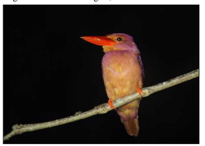
Ruddy Kingfisher

Tangkoko was as fabulous as ever and rewarded us with wonderful sightings of both birds and mammals. Some of the highlights here included