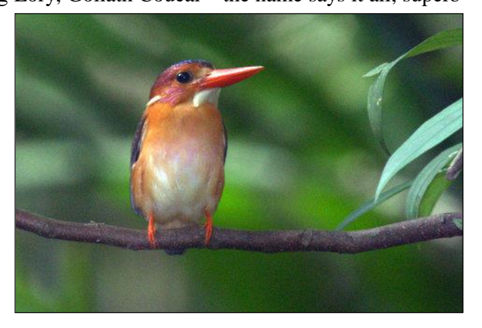
Sulawesi Dwarf Kingfisher

scope views of Moluccan Drongo-Cuckoo, Moluccan Scops Owl, Halmahera Boobook, a pair of the rare Azure Dollarbird, elusive Sombre Kingfisher, Blyth's Hornbill, White-streaked Friarbird, Halmahera and Moluccan Cuckooshrikes, Dusky-brown Oriole, Long-billed Crow, Creamthroated White-eye, Moluccan Starling and Dusky Myzomela. The undoubted highlight here, however, was a fabulous male Standardwing displaying to three females for half an hour! We all stood in awe as we watched this wonderful show, the male constantly waving his standards and dancing from branch to branch as soon as a female approached his display area. This truly was an incredible birding