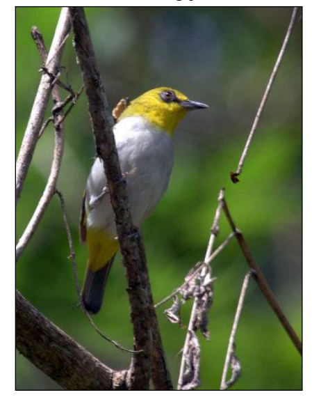
Black-ringed White-eye

Our tour started off with an early morning visit to the limestone crags of Karaenta Forest, Sulawesi. Departing Makassar, we set off early to maximise our limited time as we had a flight to catch in the early afternoon. Arriving just as the sun's first rays hit the treetops, we were soon enjoying wonderful sightings