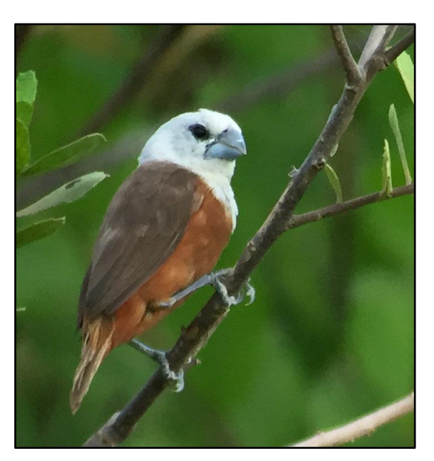
Pale-headed Munia by David Erterius

Part of Indonesia's nearly 17,000 islands, and considered one of the endemic hotspots of the world - the islands between Borneo and New Guinea form a biogeographical connection between the Oriental and Australian avifauna. The region is often called Wallacea, after the English 19<sup>th</sup>century explorer Alfred Russel Wallace, and consists of three distinct subregions: Sulawesi, the Lesser Sundas and the Moluccas. On this trip, we focused on two of these subregions - the island of Sulawesi and the Moluccas, the latter by visiting the island of Halmahera. These two relatively large islands still support some of the most spectacular birds on earth, despite the increasingly devastating effects of rapid population growth and associated habitat destruction for agriculture and urban sprawl. Our tour ventured into several remote regions, including travelling through the best of these island's important natural biomes, which ranged from the scenic mountainous interior to volcanic coastal forests. During our adventurous journey, we amassed an outstanding