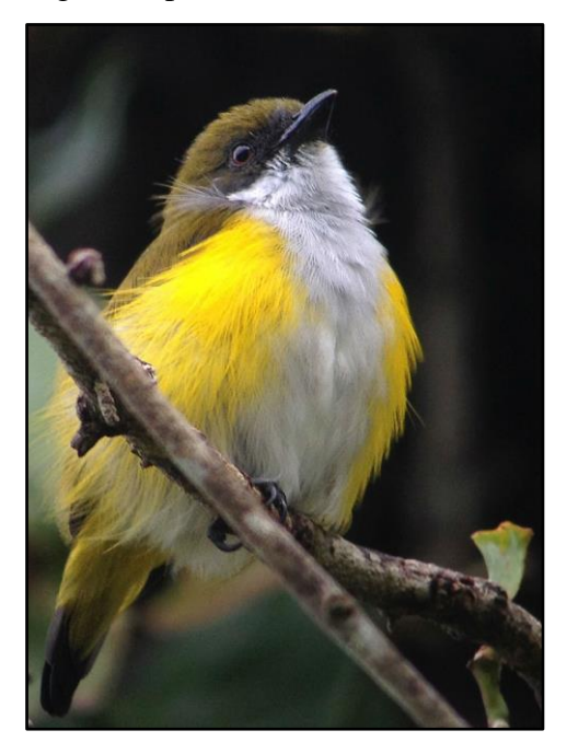
Yellow-sided Flowerpecker

Heron feeding in the ponds and we also found Striated Heron, Purple Heron and Little Egret whereas a couple of Wandering Whistling Duck and a single Yellow Bittern were flushed from the more densely vegetated ponds.