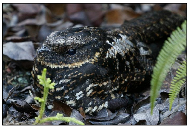
Satanic Nightjar

One of the days in Lore Lindu was entirely dedicated to the higher elevations, namely the magnificent montane forest on upper Mount Rorekatimbu. To get there, we had to hike on an old logging road, departing just before dawn in order to reach the upper forest in good time for birding. Two of our target species here were the spectacular Purple-bearded Bee-eater and the poorly-known Satanic Nightjar, only rediscovered in the late 1990's. We