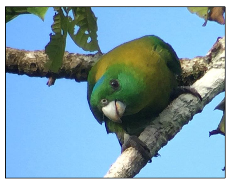
Yellow-breasted Racket-tail by David Erterius

An early departure saw us arriving at the entrance of the Maleo-area, and as we were waiting for the gate to open, we had our first views of Black-billed Koel and managed additional ones of Grey-rumped Treeswift. After a concerted effort in various parts of the forest, both closed and more open ones, we managed to track down a splendid pair of Maleo, perched quietly high up and well hidden inside a huge tree, in order to escape danger. Our explorations of this forest also produced our first sightings of Grey-cheeked Green Pigeon, Green-backed Kingfisher, Ashy Woodpecker and White-rumped Triller and additional views of Great Hanging Parrot and Pale-blue Monarch. A quick stop at some rice paddies on the way back from the Maleo