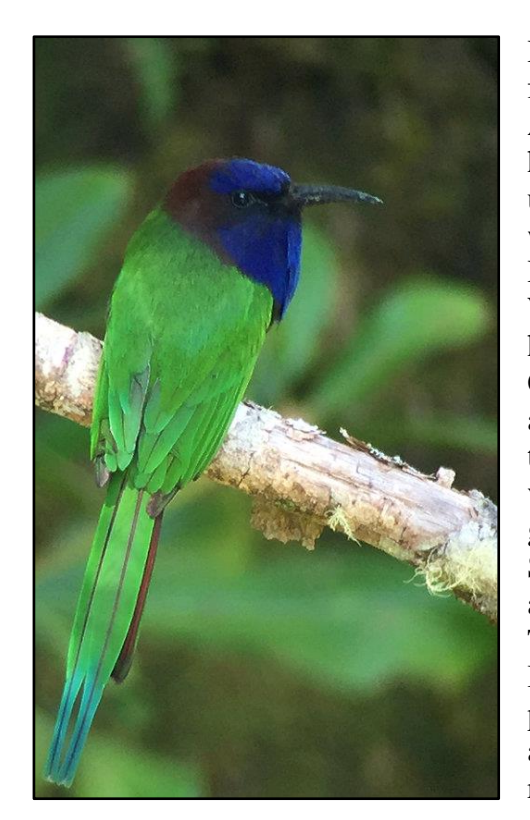
Purple-bearded Bee-eater by David Erterius

Dawn was coming quickly and we soon found ourselves at the front office in the forest proper, ready for some real forest birding. As the forest slowly became more vibrant and alive, we realised how productive the nowadays relatively small patch of good, untouched montane rainforest at the heart of the National Park is, with a plethora of interesting species. Slender-billed Cuckoo-Doves and small parties of Citrine Lorikeet, Black-crowned White-eyes and Fiery-browed Starlings were all busy feeding high up in the canopy and a little lower, single Pygmy Cuckooshrikes. Rusty-bellied Fantail, Citrine Canary-Flycatcher and Turquoise Flycatcher were all at the lower to mid-level of the trees. A Yellow-billed Malkoha showed up and offered the best views of the trip. Venturing along trails into the forest, we had good looks at Sulphur-vented Whistler, Dark-eared Myza, Sulawesi Babbler and Blue-fronted Blue Flycatcher. A more open area between the forest and a small lake yielded Grey-rumped Treeswift, Collared Kingfisher, White-breasted Woodswallow, Black-naped Oriole, Short-tailed and Grosbeak Starling, all perched up nicely in tall dead trees, whereas Little Pied Flycatcher and Mountain White-eye showed well at eye-level. Back at the road that bisects the forest, we found even more Sulawesiendemics, namely the fine-looking Red-eared Fruit Dove, the velvety blue-grevish Cerulean Cuckooshrike, dainty Sulawesi Myzomela and the tricky Crimson-crowned Flowerpecker and