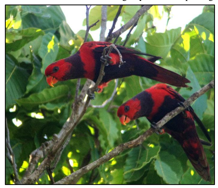
Violet-necked Lory

Halmahera Swiftlet were hawking for insects high overhead and we were fortunate to get brief views of the tricky Moluccan Goshawk. One of