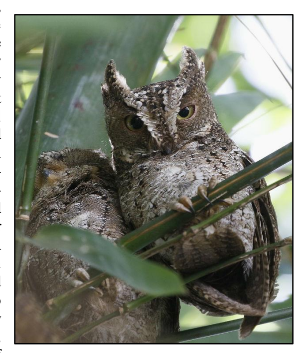
Sulawesi Scops Owl by David Erterius

Kingfisher, Pygmy Hanging Parrots, Pied Cuckooshrike, Sulawesi Mynas feeding in a fruiting tree by the roadside and several White-necked Mynas. A bonus were the five Gorontalo Macaques that we found across a valley, busy feeding in the foliage of tall trees. Other noteworthy sightings in this area were our first Black-naped Fruit Doves and Crimson Sunbirds of the trip and additional lengthy scope views of calling White-faced Dove and further looks at both Knobbed Hornbill and Sulawesi Hornbill. We also caught up with better views of Greyheaded Imperial Pigeon, Purple Needletail and Ivorybacked Woodswallow. Heading to another forest patch and descending slightly, we had another delicious lunch on our arrival, cooked by our lovely private cook, Anne. A juvenile Rufous-bellied Hawk-Eagle gave perfect open views through the scope and a Common Kingfisher showed briefly, both along a nearby stream before it was time to cross by a raft, allowing us access to the forest proper by mid-afternoon. Having walked along the trail for a while, glimpses of an unidentified ground-dweller by the side of the trail turned out to be a Red-bellied Pitta.