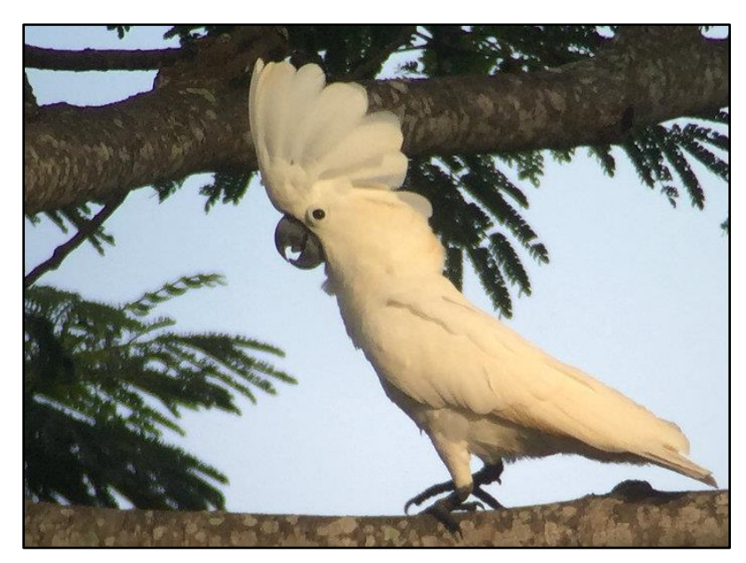
White Cockatoo

The undoubted highlight here, however, was the four males of the fabulous Standardwing displaying to three females for half an hour at eye-level some one-hundred feet away! We all stood in awe as we watched this wonderful show, the male constantly flapping his wings, exposing his standards and dancing from branch to branch as soon as the female approached his display area. This truly was an incredible birding experience and one that I suspect we will all cherish for as long as we live!!! Back on the coast at Sofifi, we finally managed to find a cooperative Beach Kingfisher which showed well for all. Returning to the