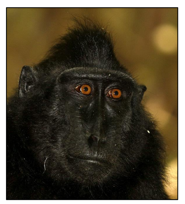
Celebes Crested Macaque by David Erterius

A little further ahead, we managed to connect with another one, although also showing all too briefly. Reaching the edge of the forest and an area of open farmbush, we were lucky to obtain fantastic perched views of Yellow-breasted Racket-tail (this species is often just seen flying by). At this spot, we also had our first sighting of Silver-tipped Imperial Pigeon and we heard the characteristic "barking" note of Oberholser's Fruit Dove, although it was reluctant to show itself.