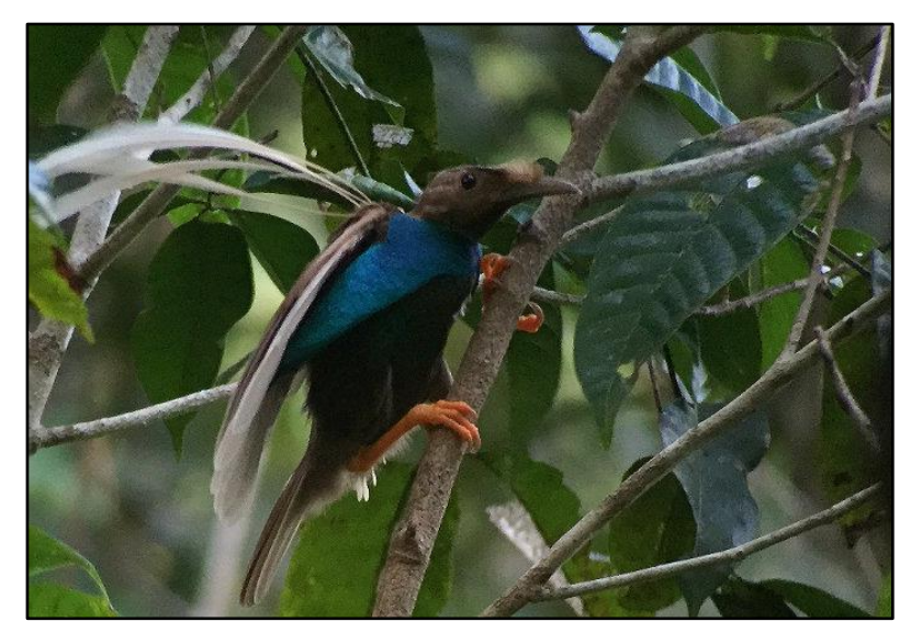
Standardwing by David Erterius

our main quarries in this area was the magnificent Ivory-breasted Pitta, and every now and then we could hear the wonderfully distinctive "wolf-whistle" song of the species, if somewhat always a little too distant. However, we found one individual sitting much closer to the road and next, a small trail had us walking into a massive bamboo stand in order to find a good spot for watching the bird.