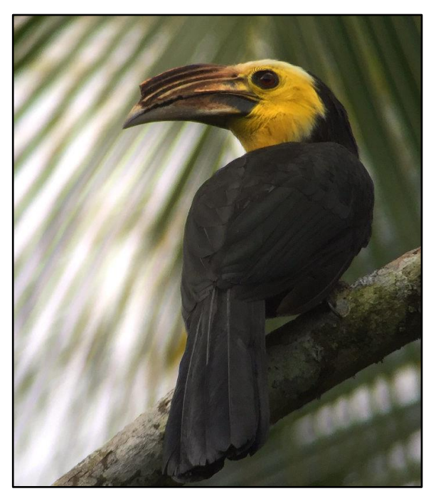
Sulawesi Hornbill by David Erterius

The birding commenced in the afternoon on our first day, as we headed to an area of rice paddies and ponds, mixed with farmbush and grassland. As we were nearing the area, a nice male Spotted Harrier was spotted from the vehicles and we could study it for a few minutes as it was soaring high overhead, being constantly mobbed by a White-breasted Woodswallow. Arriving at the spot, with relatively little effort, we managed to find a good selection of species and were treated to some nice introductory birding. As we walked along the embankments, we enjoyed good numbers of Javan Pond