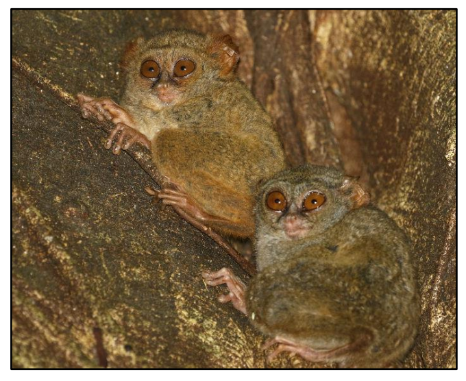
Spectral Tarsier

foraging on the forest floor, two skulky Isabelline Bush-hens that proved difficult to get good looks at, three cute day-roosting Sulawesi Scops Owls right at our lodge's restaurant (!) and better looks at Silver-tipped Imperial Pigeon and additional looks at Green-backed Kingfisher. The Tangkoko Forest is also renowned for its mammals, and we enjoyed having a look at Bear Cuscuses peering down at us from their roost high up in massive trees, we found the tiny and extra-terrestrial looking Spectral Tarsier at its day-roost in a hollow tree, as well as troops of the funny "moai-looking" Celebes Crested Macaque. Not that it stopped there, a boat trip on a nearby small creek, surrounded by extensive mangroves yielded the bizarre-looking Great-billed Kingfisher and White-rumped Cuckooshrike, both rather localised endemics.