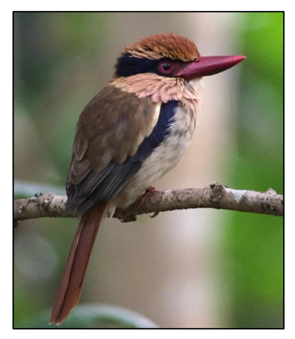
Lilac Kingfisher by David Erterius

island of Ternate by boat, we enjoyed single Greater Crested and Common Terns and had brief views of a small party of Red-necked Phalarope whizzing by.