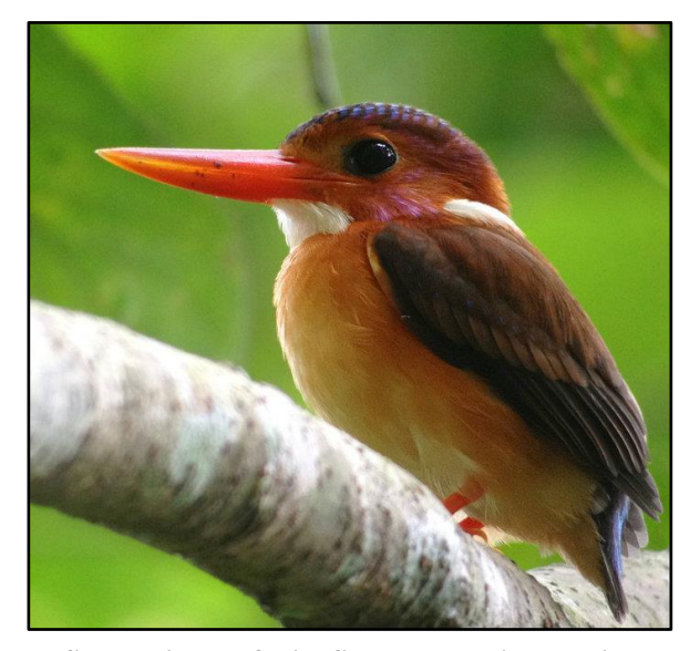
Sulawesi Dwarf Kingfisher

We then had a full transfer-day as we travelled via domestic flight to Manado in the Minahassa region, further north-east, before continuing by driving towards Kotamobagu. Some roadside birding along the way between Manado and Kotamobagu produced a few new birds for the trip, such as Sunda Teal, Buff-banded Rail and White-browed Crake and we had even better views of a male Spotted Harrier that was patrolling low over the rice fields. Our two full days of birding in Dumoga-Bone National Park commenced by visiting a protected section of lowland rainforest, where a conservation programme for the endangered Maleo has been implemented at nesting grounds in the forest - with hatchery projects and improved guard patrolling.