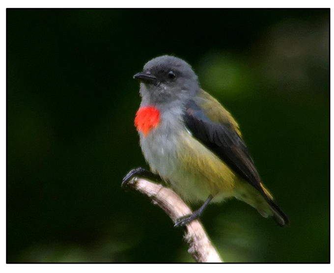
Halmahera Flowerpecker

And so ended another wonderful and richly rewarding adventure through one of the world's endemic hotspots. Our final night together on the island saw us enjoying a scrumptious farewell dinner followed by a good night's sleep, before catching our departure flights home. Thanks once again to yet another wonderful group of enthusiastic and fun participants as well as a superb ground operations team. I am very much looking forward to travelling with you all again!