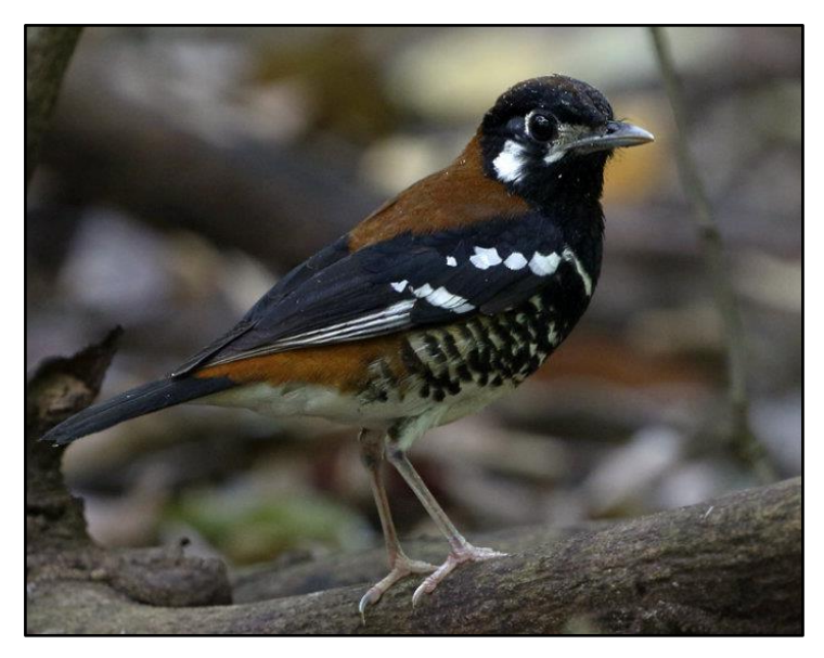
Red-backed Thrush by David Erterius

Leaving Sulawesi, we next boarded a flight from the city of Manado and flew east, across the so-called Weber's Line and into a new biome, the Moluccas. Arriving at the volcanic island of Ternate, we then transferred swiftly by speed boat to the main island, Halmahera. The afternoon was spent in a mangrove forest a bit south of our town on the west coast, primarily to look for Beach Kingfisher. Greyheaded Fruit Dove and Sombre Kingfisher were both new additions to the endemics list and other new species here were Pink-necked Pigeon, Pied Imperial Pigeon, Moustached Treeswift. White-bellied Cuckooshrike and Willie Wagtail. The Beach Kingfisher was, however, only heard and glimpsed by some. The next morning started off with some roadside birding in the remnant