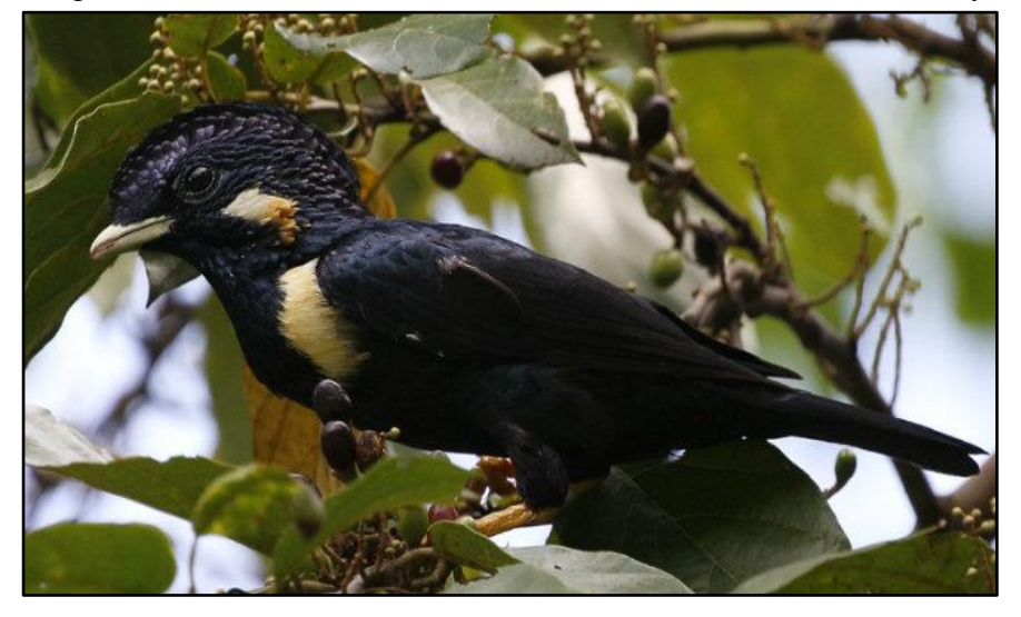
Sulawesi Myna

of very exciting birding in the exceptionally bird-rich Lore Lindu National Park, which harbours nearly all of Sulawesi's montane birds. The birding here kicked-off in earnest on the next day, just before the crack of dawn, in order to try for the relatively recently described Cinnabar Boobook, one of the several endemic owl-species on Sulawesi. With relatively little effort, we managed to coax one bird in and enjoyed subsequent great looks at it for a couple of minutes or so, before it flew off.