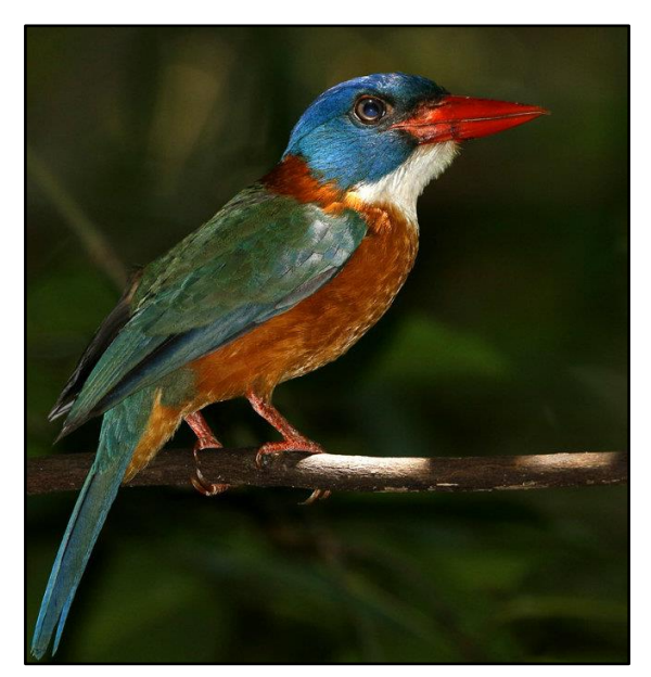
Green-backed Kingfisher by David Erterius

managed to connect with the former twice, along the upper stretch of the track and further down, at a huge landslide whereas we found a total of four birds of the latter.