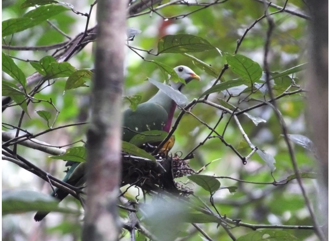
stopped several times to watch Red-breasted Paradise Kingfisher, Orange-bellied Fruit Dove and Golden Myna and Wompoo Fruit Dove.

We heard the calls of King Bird of Paradise and Magnificent Riflebird but we could not see them. Suddenly it started to rain. We reached the village at around 17:00. We were able to see Blyth's Hornbill, Pinon