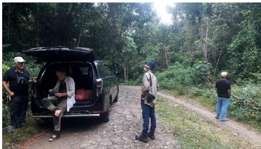
Fig 3. Afternoon and Night Birding in Kisol

After fifteen minutes of sightseeing, we went over to Borong Village and began planning the upcoming decisions. Finally, we arrived in Borrong and transferred to the Kharisma Hotel at 15:59. The hotel is quite comfortable and very close to the Kisol, where the location for birding is. Ten minutes later, we headed away to Kisol and prepared for the afternoon and night birding. We made it there at 16:29, which is about 30 minutes from the hotel.