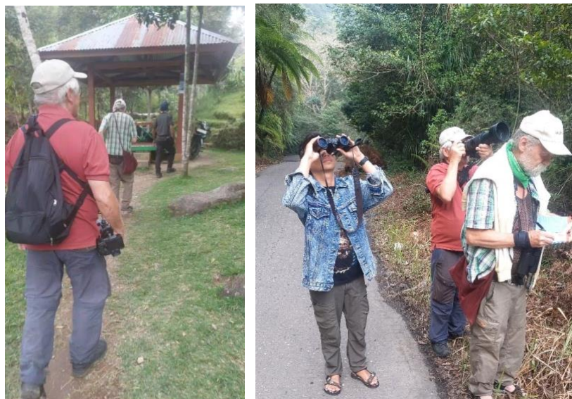
Fig 8. Golokusang Afternoon Birding