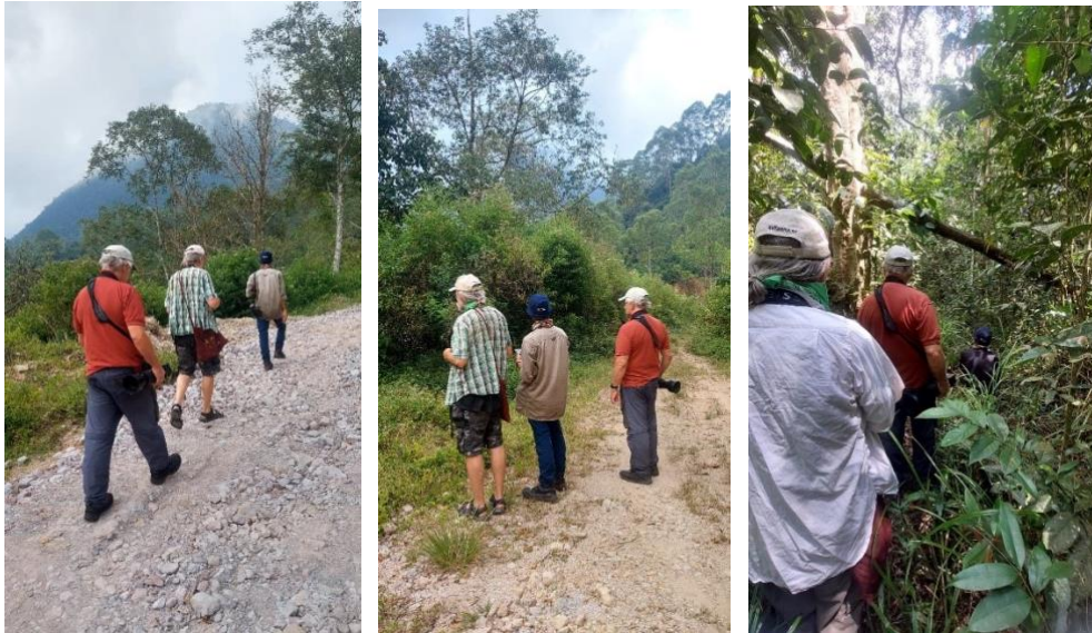
Fig 10. Afternoon Birding in Gololusang

this region. Tomorrow, we will continue our journey to Labuan Bajo, the final destination of our trip.