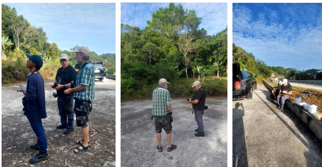
Fig 1. Puarlolo birding site