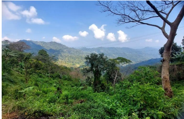
Fig 7. Pagal Roadside Birding