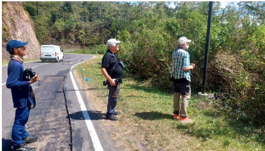
Fig 2. Road site Birding

be spotting them in Pagal. Furthermore, we stopped at the spot at 10:32, tried roadside birding before heading to Borong village.